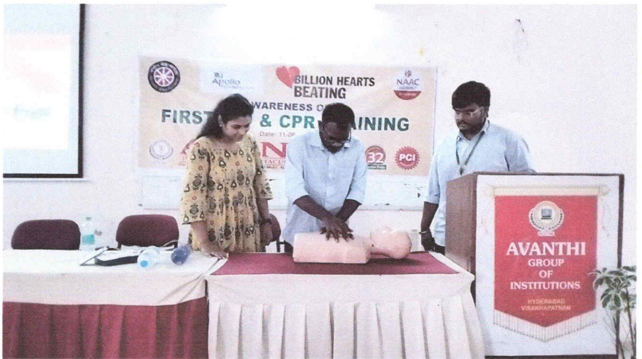
STUDENTS PRACTICING CPR ON MANNEQUIN