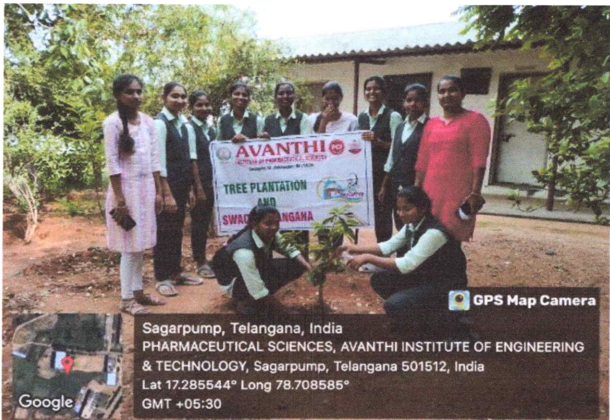
Tree plantation and Swachh Telangana program

Avanthi Institute of Pharmaceutical Sciences has conducted Tree plantation and Swachh Telangana program on 22-06-2023. On the said occasion, we have conducted various competitions involving all pharmacy students . There was a good response from the students and have participated in tree plantation with utmost respect and planted number of saplings.