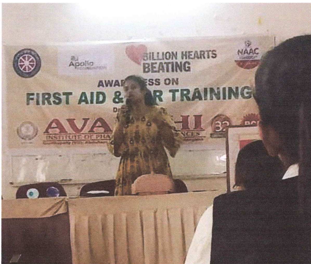
Awareness program on FIRST AID & CPR TRAINING